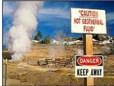
Chevron says geothermal energy "makes economic sense"

"We will do our very best to advise, to help people understand what can be done and to see whether we can come up with processes that will provide people with energy from a different source," he added.