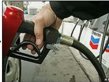
Chevron last year made the highest profits in its 126-year history

The world's fifth-largest oil company, Chevron, has invested $300m (£173m) a year in technology to support new energy sources, fearing oil and gas prices will continue to rise, one of the company's leading figures has told the BBC.